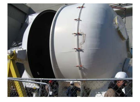
Top left: The MMTO belljar awaits transport from the FLWO basecamp. In the near background, VERITAS 12-m telescope #4 awaits its final mirror segments.

Top right: The belljar is rotated vertical in the SOML parking lot.